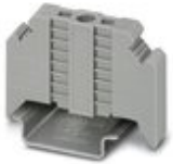
End clamp, width: 9.5 mm, color: gray